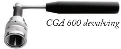
CGA 600 devalving tool