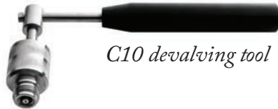
C10 devalving tool

1590 99th Ln NE, Minneapolis, MN 55449 763-786-4020