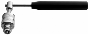
C10 devalving tool

Premier devalving tools provide an effective tool to dislodge/disable valves on empty gas cylinders, thus providing the safe evacuation of excess gas before recycling or disposing of the cylinder.